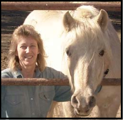
Calif. Lic. #01766461