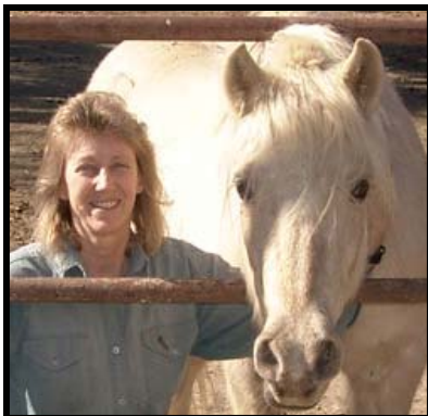
CalBRE Lic. #01766461